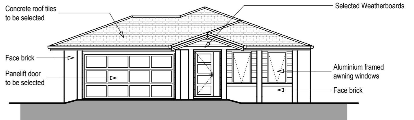
Elevation - Option 2